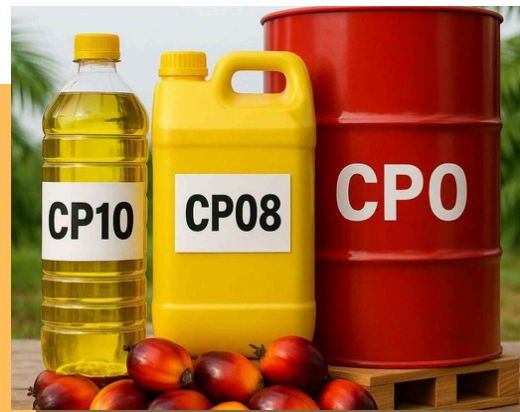
RBD Palm Olein CP10, CP8, CP6