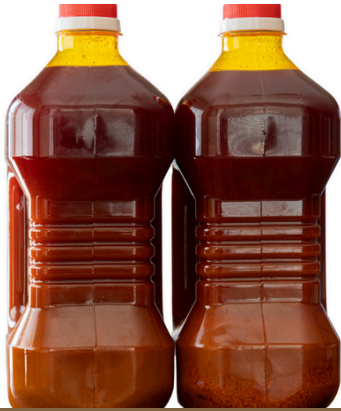
Crude Palm Oil